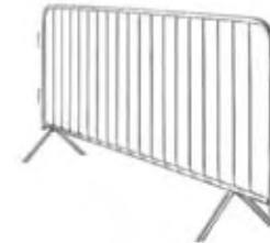
A complete galvanised crowd barrier complete with two raised fixed feet.